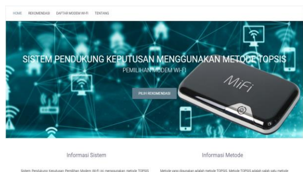
Figure 2. System Main Menu Interface

After the TOPSIS analysis has been carried out, the TOPSIS algorithm is applied in a decision support system to choose a Wi-Fi Modem with the PHP programming language Notepad++ and the database using MySQL. The interface display on the decision support system for selecting a Wi-Fi modem is presented in Figure 2.