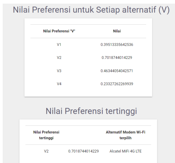
Figure 4. The Best Alternative Results Interface

After inputting the alternative data, system users can select a Wi-Fi Modem via the Recommendations menu. In this menu, system users will give weighting to each criterion. Then, the user can continue it by pressing the Calculate menu. The system will show the calculation process using the TOPSIS method in the calculate menu. In addition, the system also presents recommendations in the form of the best alternative results. Figure 4 below is a display of the TOPSIS calculation results.