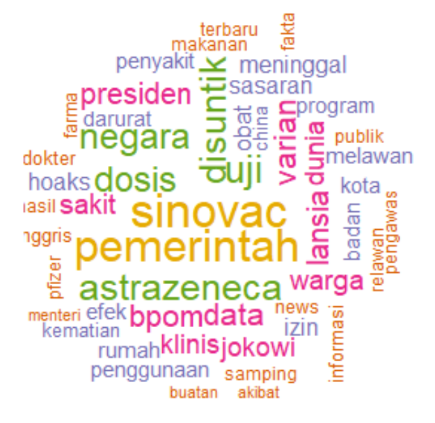
Figure 6. Wordcloud from the content with negative sentiment by the news portals.

From the four wordclouds that have been presented previously, it can be seen that "government" is the most common topic for both positive and negative sentiment contents posted by either the government news portals accounts discussing the COVID-19 vaccine. It only makes sense since the government is after all the main actor behind this vaccination work, hence the spotlight. Meanwhile, "Sinovac" is commonly mentioned in news portal posts, both in positive and negative sentiment content, which is not the case for the government accounts. It seems like the government did not want to emphasize the vaccine