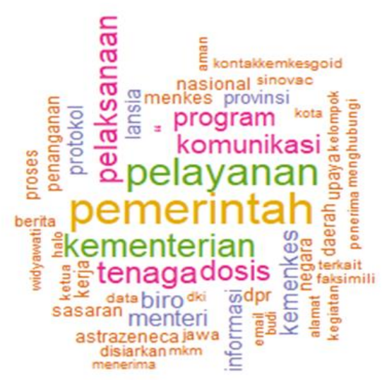
Figure 3. Wordcloud from the content with positive sentiment by the government accounts

Vol. 3, No. 4 September 2021 DOI: https://doi.org/10.34288/jri.v3i4.101