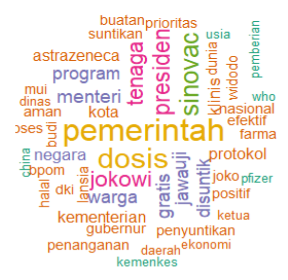
Figure 5. Wordcloud from the content with positive sentiment by the news portals.

Figures 5 and 6 show word cloud data visualization regarding positive and negative content from news portals. The picture shows that in positive news content the words or topics that appear most often are "pemerintah" (government), "dosis" (dose), and "Sinovac". While the negative content of news portals, the words or topics that appear most often are "Sinovac", "pemerintah" (government), and "uji" (trial).