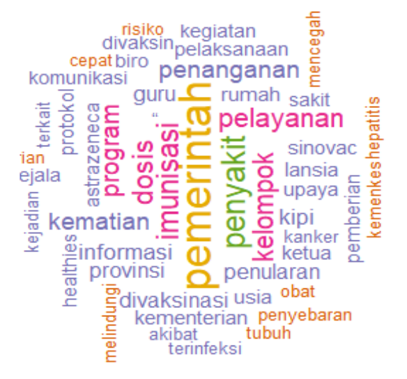
Figure 4. Wordcloud from the content with negative sentiment by the government accounts

Figures 5 and 6 show word cloud data visualization regarding positive and negative content from news portals. The picture shows that in positive news content the words or topics that appear most often are "pemerintah" (government), "dosis" (dose), and "Sinovac". While the negative content of news portals, the words or topics that appear most often are "Sinovac", "pemerintah" (government), and "uji" (trial).